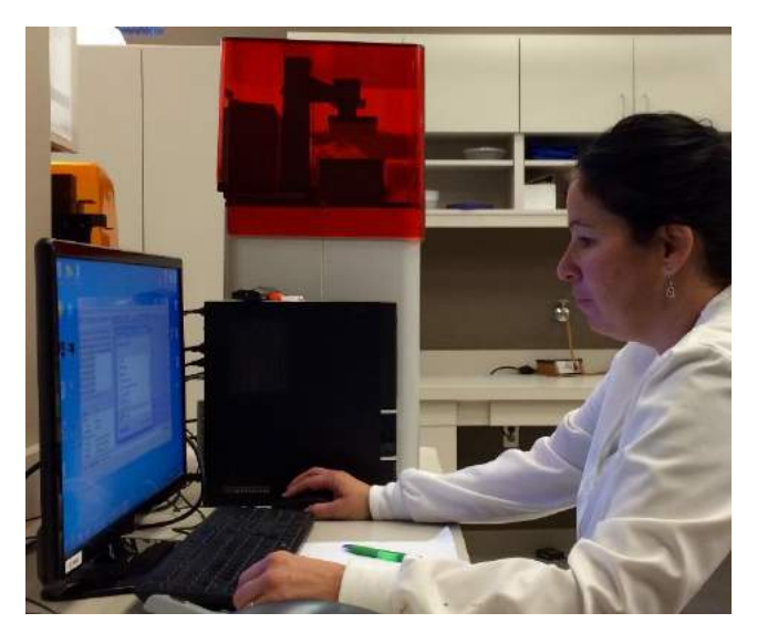
Dr. Lin's lab recently expanded to three technicians to accommodate the increasing amount of work as a result of their 3D printing technology and business growth.

OSGB offers a full range of orthodontic treatments, including invisible braces, Invisilign, SureSmile aligners and more. In the past, many of those solutions have depended on external vendors and manufacturers, who often charge high fees to develop products for individual patient needs.