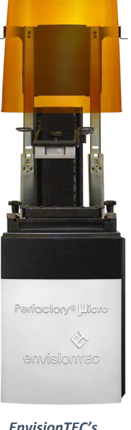
EnvisionTEC's original Micro Ortho model has been replaced by the Perfactory Vida.

He looked at brands such as Stratasys and 3D Systems but decided to go with EnvisionTEC for some key reasons, such as precision for the price, print speed and the curing process. "My concern was over time there could be some distortion issues" without a final cure, Lin said, noting that it's not uncommon to reuse a mold if a patient loses a retainer. He wanted to be assured of its durability.