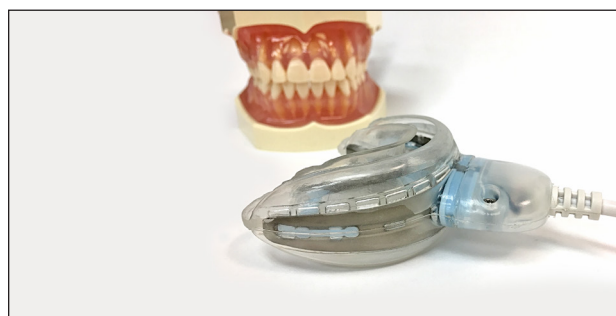
P5 supports businesses in the production of a range of products, from toys to medical equipment.

"The ease of use, the amount of detail we get and the vast materials selections available was something that was missing in most every other manufacturer that I saw out there."