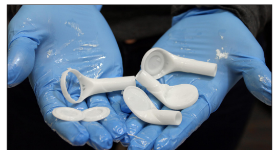
Prototype parts produced with the in-house EnvisionTEC Perfactory 3D printer.

Within the research and development process there is a need for multiple prototypes and iterations of those prototypes. With traditional manufacturing methods those prototypes are often hand crafted, made from molds or milled.