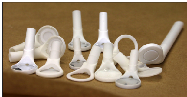
Multiple iterations of a prototype can be printed simultaneously. Speeding up the decision making process.